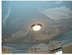
A ceiling painted with clouds.