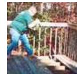
Deckboard Removal Tool