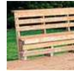
Deck Bench Brackets