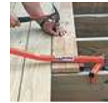
Bowrench Deck Tool